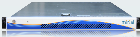
Mirial Carrier Server

Desktop videoconferencing for Carriers and Service Providers