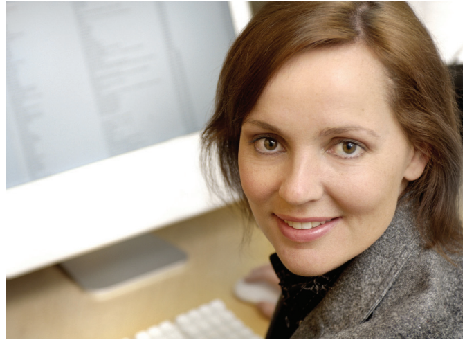
Live Video Operators